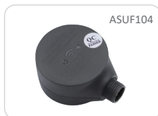
• Bluetooth ultrasonic fuel sensor (range 250cm)