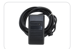
• RFID reader