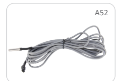
• Digital temperature sensor