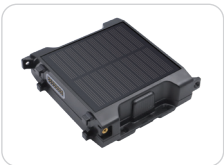
• Battery box