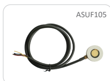
• Ultrasonic fuel level sensor (range 400cm)