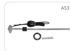
• fuel level sensor (analog input voltage)