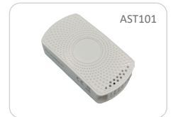
• Bluetooth temperature and humidity sensor