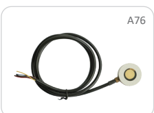
• Ultrasonic fuel level sensor (range 400cm, None AD analog output)