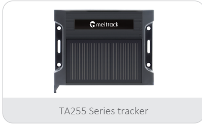
TA255 Series tracker