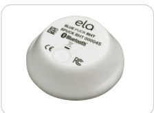
• Bluetooth temperature and humidity sensor