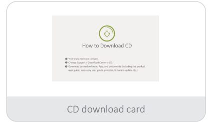
CD download card