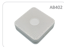
• Bluetooth beacon