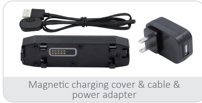
Magnetic charging cover & cable & power adapter