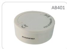
• Bluetooth beacon