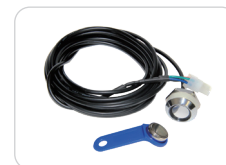
• iButton reader